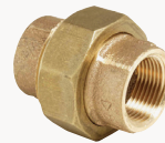
Female Straight Union Coupler (Coned Joint)