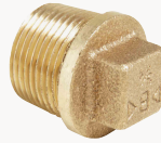
Beaded Blank Plug Male Thread