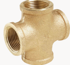
Cross - Equal Female All Ends