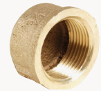
Blank Cap Female Thread