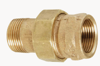
Male x Female Straight Union Connector (coned joint)