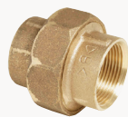
Female Straight Union Coupler (Flat Joint)