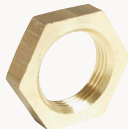
Brass Locknut Female Thread