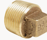
Plain Plug Male Thread